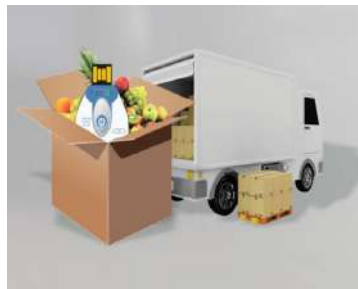
Put into the box / carton