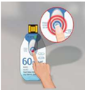
Press the button to start